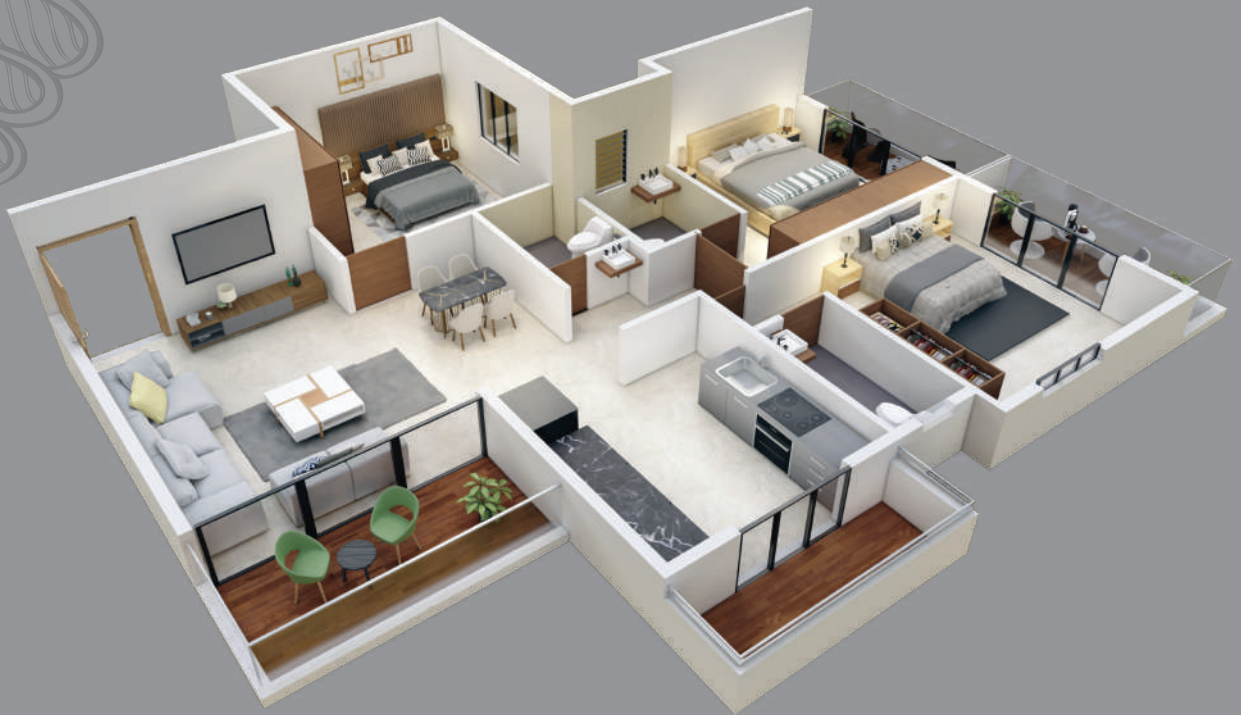
3BHK CUT VIEW 1545 SQFT